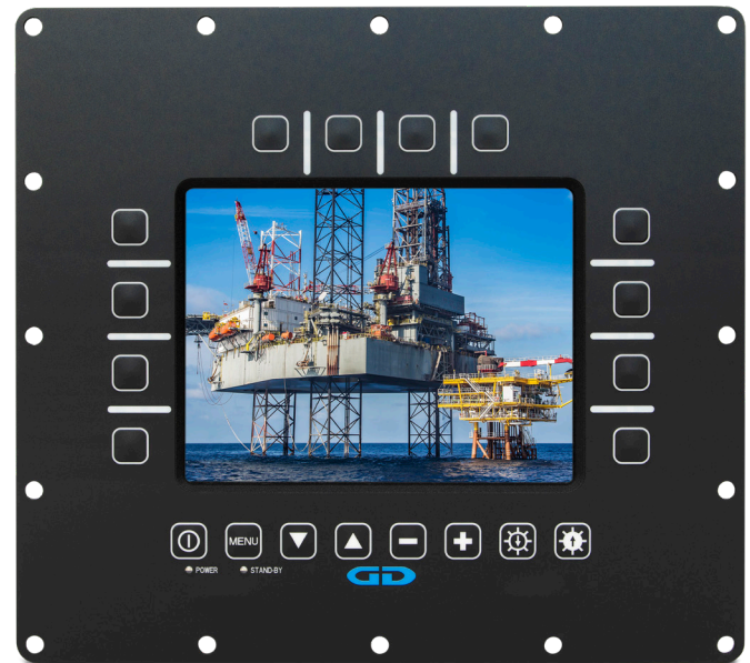
Mil-spec Saber PanelMount Solar 6.5 UPB shown with custom bezel buttons, and lacks a rear enclosure to simplify mounting

This sunlight readable LCD monitor comes equipped with a double-sided antireflective overlay with ITO coating for EMI shielding.